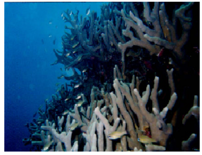
Figure 1- Porites cylindrica on Pioneer Bay Reef of Orpheus Island. Note the coral's stubby digitate morphology which classifies it as having a bushy growth form as defined by Jackson (1979).

allows growth in many directions, P. cylindrica is likely to follow Jackson's model for morphology and be a fugitive strategist. The species has very small polyps, as well as short tentacles. It also lacks welldeveloped defense structures like mesenterial filaments or sweeper tentacles, and is often the loser in competitive interactions with other coral species in a laboratory setting (Willis, pers. comm.). Like any branching coral, P. cylindrica is subject to breakage, a costly injury (Hall 1996). And yet, amidst qualities which would seem to detract from the fitness of a coral species, P. cylindrica is able to successfully dominate much of a reef without being threatened by environmental changes or by other coral colonies looking to advance. I was interested in researching what life history trait advantages P. cylindrica has gained while compromising the ability to actively defend itself from aggressive corals.